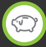
Pre-Tax Payment/ Contribution