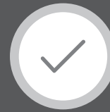
After Eligible Expense